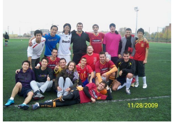
Because learning Spanish is much more than attending classes